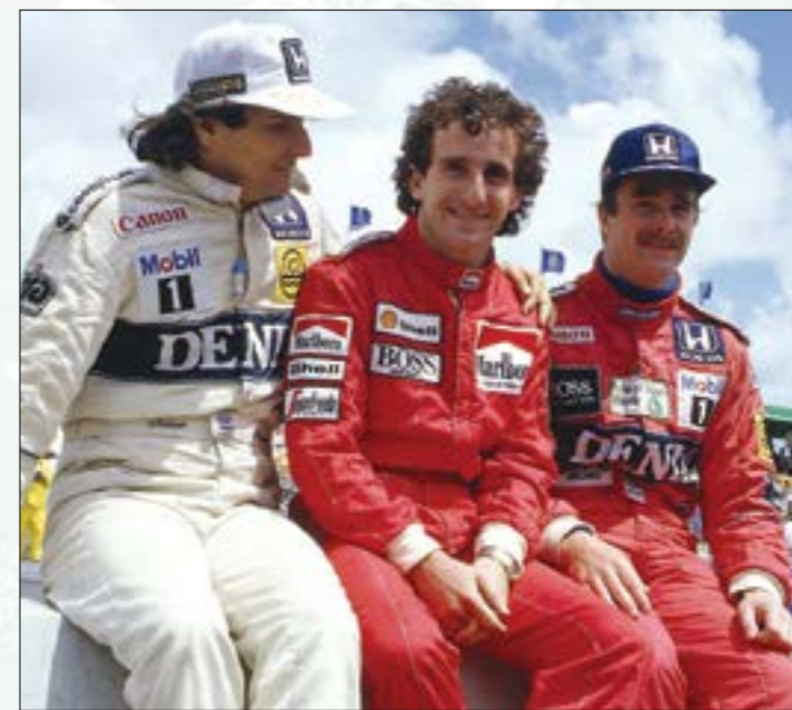
Quite a line-up - (l-r) three time world champion, Nelson Piquet; four time world champion, Alain Prost; and the Isle of Man's Nigel Mansell, the only driver to win the F1 world championship and Indy Car World Series in back to back seasons.

Alain Prost was a four-time world champion Formula One driver who exploded on to the motor-racing scene, finishing in the points on his Formula One debut at the age of 25. The smooth, self-assured Frenchman went on to become a dominant and imperious figure in the sport throughout the 1980s and early 1990s.