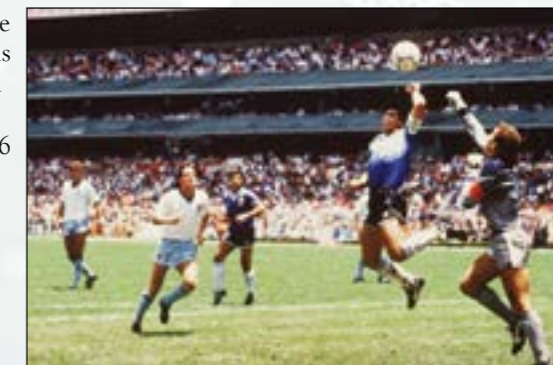
England goalkeeper Peter Shilton tries in vain to beat the outstretched arm of Diego Maradona.