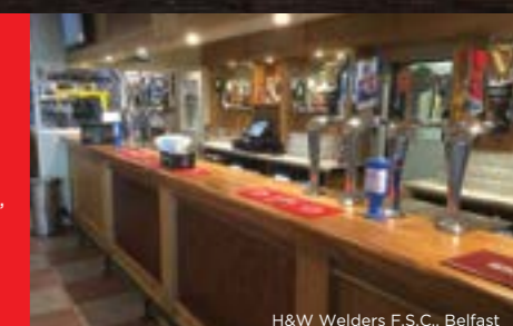
H&W Welders F.S.C., Belfast

Contact us for a free quote on 02891 478000