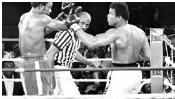
Muhammad Ali and George Foreman in their legendary bout, held in

The Rumble in the Jungle was a historic boxing event in Kinshasa, Zaire (now Democratic Republic of the Congo) on 30th October 1974. Held at the 20th of May Stadium (now the Stade Tata Raphaël), it pitted the undefeated world heavyweight champion George Foreman against challenger Muhammad Ali, the former heavyweight champion.