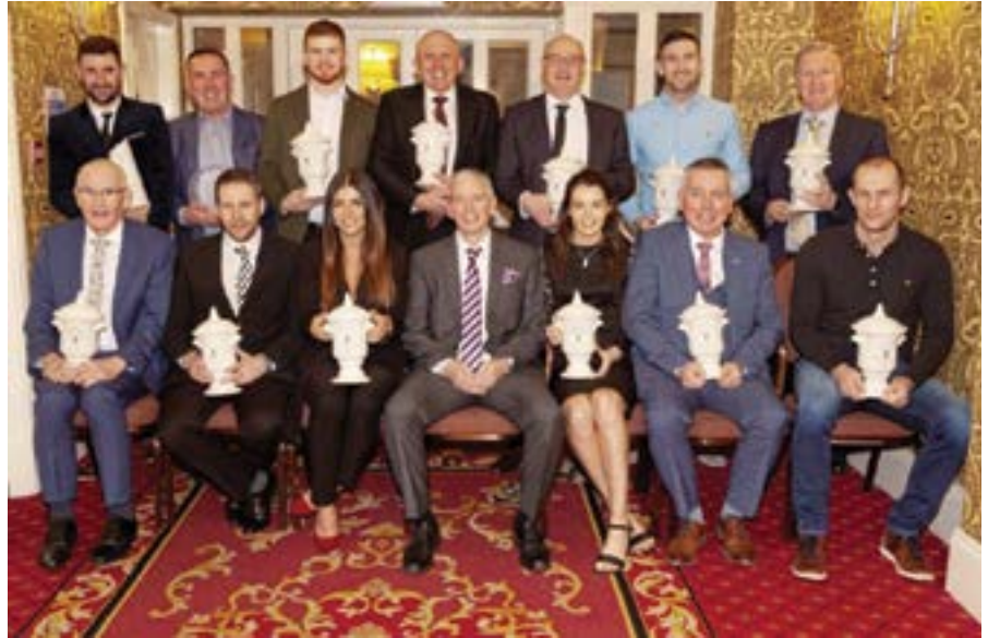
Ulster GAA Writers award winners for 2019.