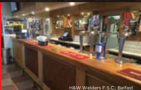
H&W Welders F.S.C., Belfast

Contact us for a free quote on 02891 478000