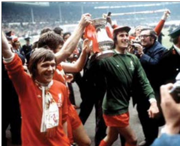
Ray Clemence and Brian Hall celebrate their 3-0 FA Cup triumph over Newcastle United at Wembley Stadium.

The 1974 FA Cup Final between Liverpool and Newcastle United was held at Wembley Stadium on Saturday, 4 May 1974. Liverpool were appearing in their fifth final and Newcastle in their eleventh, which was a record at the time. Liverpool had won the FA Cup once, in 1965, and Newcastle six times, most recently in 1955.