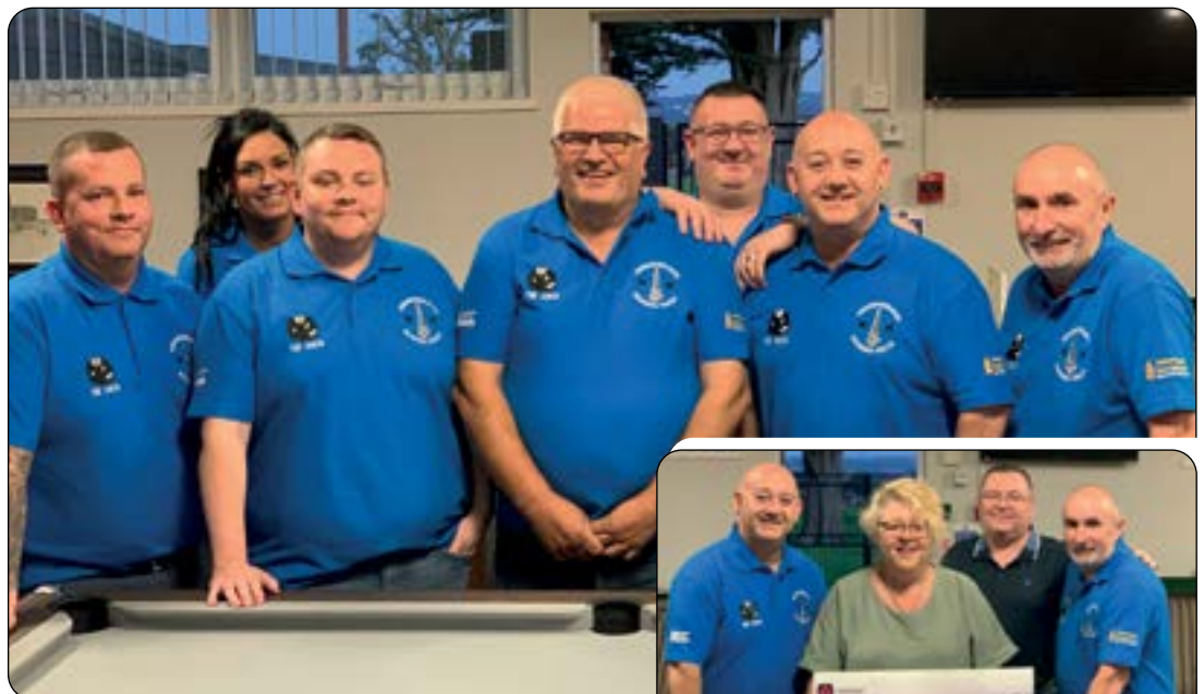
Above: The Greenisland Colts pool team.